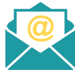
Send Invoices & Collect Payments Online