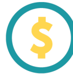
Add Technology Fees to Invoices