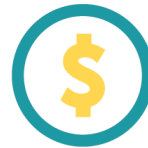
Add Technology Fees to Invoices