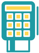
Intergrated Virtual Terminal